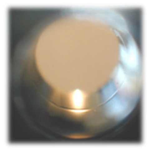
View through an inspection microscope. Clearly visible is the drawing ring in the reduction cone. The drawing die needs to be recut.